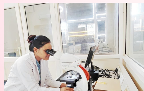
Phase contrast Microscope